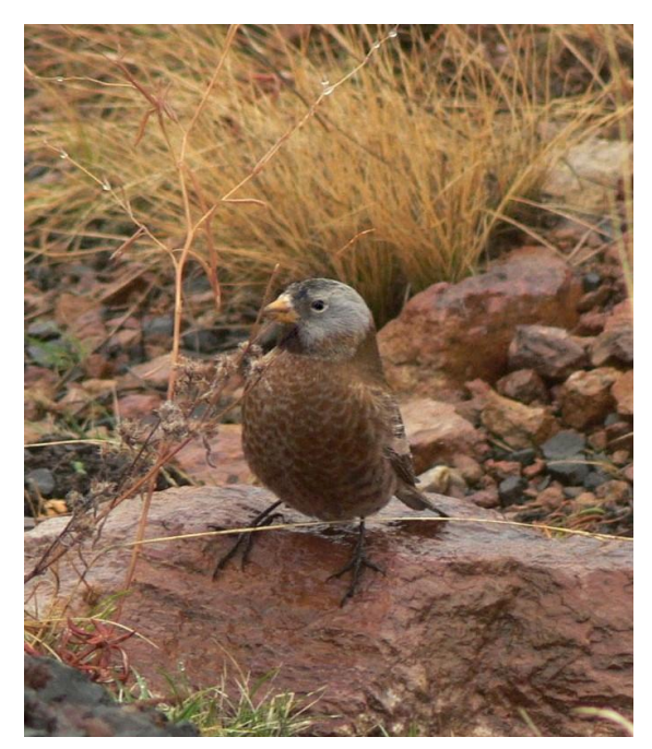
GRAY-CROWNED ROSY-FINCH Grizzly Mt, Crook County, 11/24/12

The fall is the longest of the 4 birding seasons. It is largely accepted that the fall birding season runs from August 1 to November 30. This is but one reason why the fall season produces more rare birds than any other season. Fall is the time of migration and that is an additional factor. Regardless of the reasons, fall field notes provide us with some of the best bird sightings of the year.