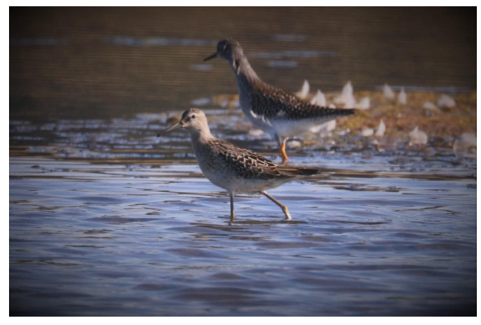
Stilt Sandpiper – Crooked R. Wetlands – Chuck Gates – 8/19/19

Shorebirds and gulls do a lot of migrating through our area and this constant movement creates possibilities for rare lost wanderers. Only 1 AMERICAN AVOCET was tallied all fall this year in our region (Poss) while at least 6 BLACK-NECKED STILTS were seen in Deschutes and Crook (Mult. Obs.). For only the 8th time, a WHIMBREL was spotted in Deschutes County (Low). Normally, SEMIPALMATED PLOVER are too common to make this report but an astounding 16 in one location at Wickiup Res. was quite unusual (Low). BLACK-BELLIED PLOVERS turned up at Wickiup on two different occasions (Jett, Low). Eleven different SOLITARY SANDPIPERS were located at various ponds around Central Oregon (Mult. Obs.). SEMIPALMATED SANDPIPERS seemed to be comparatively easy to find this year with almost a dozen birds seen at multiple locations (Mult. Obs.). A late SPOTTED SANDPIPER turned up at Redmond Sewer Ponds on 10/10 (Golden). Sparks Lk. can produce some good birds but a LONG-BILLED CURLEW in the fall is unusual (Berg). Cindy Zalunardo's backyard pond produced another rarity with a short visit from a MARBLED GODWIT on 9/20. PECTORAL and BAIRD'S SANDPIPERS were seasonally abundant and widespread but a STILT SANDPIPER at the Crooked R. Wetlands was a true rarity (Bennett,