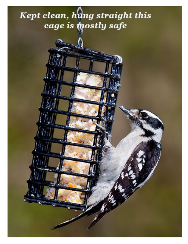
Tip 2: Protect birds from suet. Always feed

Tip 1: Feed real suet. Never let a butcher tell you that the leftover fat he'd love to get rid of works as suet. It does not. Neither do vegetable fats or oils. Vegetable fats are not in fact healthier for birds; most suet eaters are insect eaters, they're little carnivores. If a suet has to be held together with oats, cornmeal, or wheat flour, then it's not really suet. Yes, there are a lot of fakes out there. Test 1: If you can squeeze your suet cake and it smooshes, Test 2: choose another. how many unnecessary ingredients are in it (corn, wheat, and oats are fillers not food)? Suet should be suet, some seeds or nuts, some peanut butter. If you make it yourself that's fine (warm to make it pliable, suet will be already rendered or it's not suet). (Yes, a tiny bit of vegetable oil is likely ok if the suet turns out super dry). Read ingredients. (My fav, if you wish, is Peanut Delight No Melt, not cheap, lasts a long time, though.)