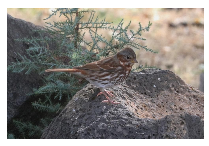
Red Fox Sparrow – Powell Butte Chuck Gates – 10/12/19