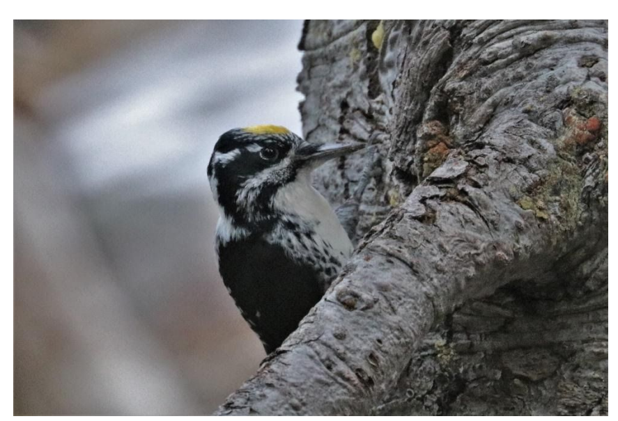
American Three-toed Woodpecker – Three Creeks Lake – Chuck Gates – 11/7/19

Nightjars, swifts, hummingbirds and woodpeckers are sometimes lumped into one group called Near Passerines. Here are some Near Passerine highlights. COMMON POORWILLS (Tank) and COMMON NIGHTHAWKS (Low, Hitt) stayed as late as 10/10 this year which is a little late.