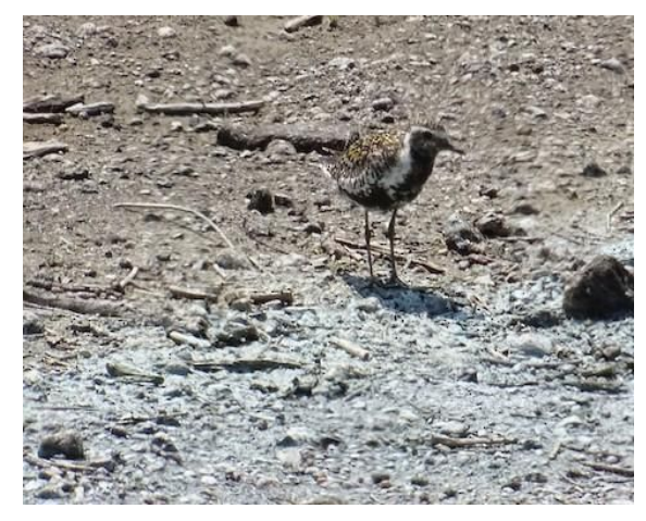
Pacific Golden-Plover, Wickiup Reservoir, 7/5/19, Craig Miller

Shorebirds provide most of the excitement for a summer report. They begin arriving in July and unusual things start to happen halfway through the month. BLACK-NECKED STILTS appeared at Wickiup Reservoir (Low). Hatfield Lake produced a single AMERICAN AVOCET in mid-July (Low, Moodie, Thomas). LONG-BILLED CURLEWS were located on Puett Road in eastern Crook County where they likely nested (Archer, Gates). A PACIFIC GOLDEN-PLOVER showed up at Wickiup Reservoir for only the 5<sup>th</sup> time in Deschutes County (Low) and nesting WILLETS were noted in their historic locations in eastern Crook County (Houle, Gates).