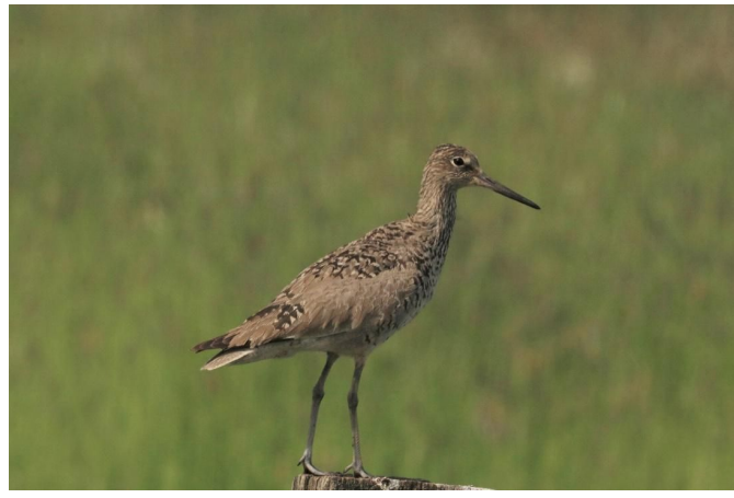
Willet, Puett Rd. Paulina, 6/10/19, Chuck Gates