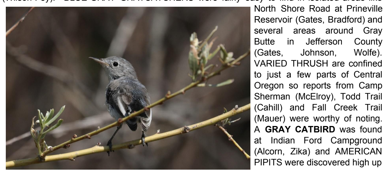
Blue-gray Gnatcatcher, North Shore Road, 7/10/19

on Brokentop for an unusual summer record (Cahill). Nesting ORANGE-CROWNED WARBLERS are not often found in the Ochocos so several records this summer were interesting (Low, Gates). A possible nesting NASHVILLE WARBLER in the same area was also unusual (Gates). YELLOW-BREASTED CHAT were located east of Prineville (MacDonald),