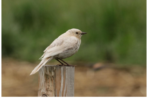
Tricolored Blackbird, Crooked River Wetlands, 7/31/19, and Leucistic Brewer's Blackbird, Crooked River Wetlands, 7/4/19

A leucistic BREWER'S BLACKBIRD spent most of the summer at the Crooked River Wetlands (Jakse). A GREAT-TAILED GRACKLE was spotted very briefly in Powell Butte (Zalunardo) and GRAY CROWNED ROSY-FINCHES were found by hikers on the North Sister (Fidorra), Brokentop (Cahill) and the Todd Lake Trail (Cahill).