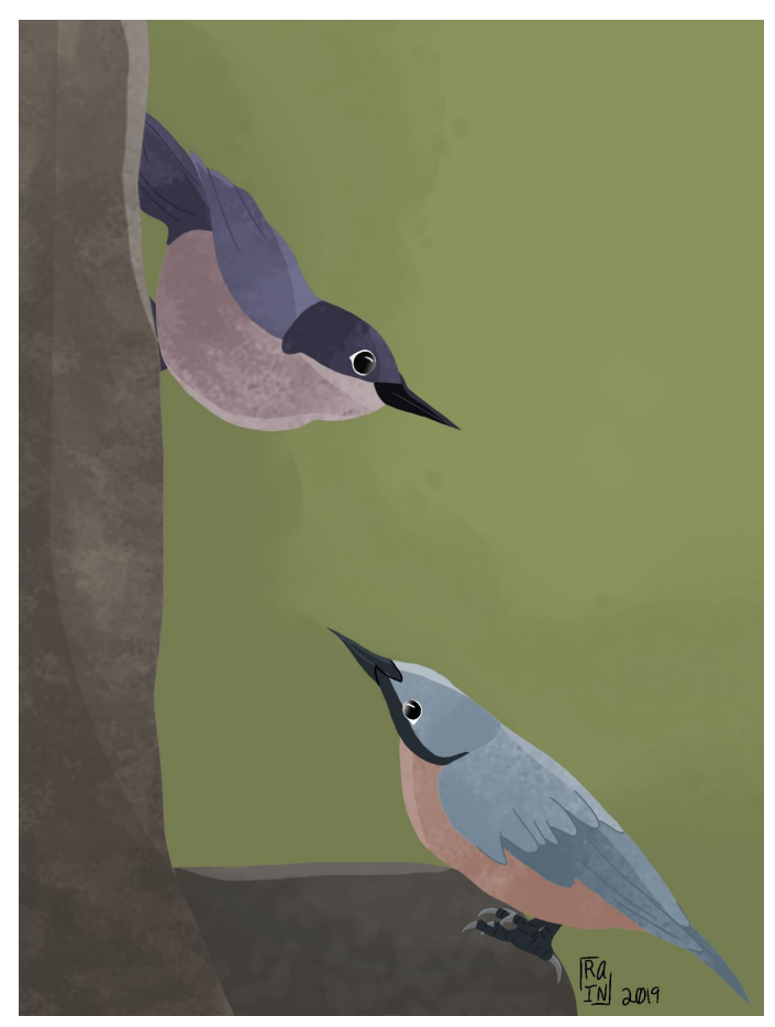
Artwork by Summitt Rain Moodie

https://www.westernfieldornithologists.org/docs/2020/WFO_2020_HS_Student_Essay_Contest. pdf