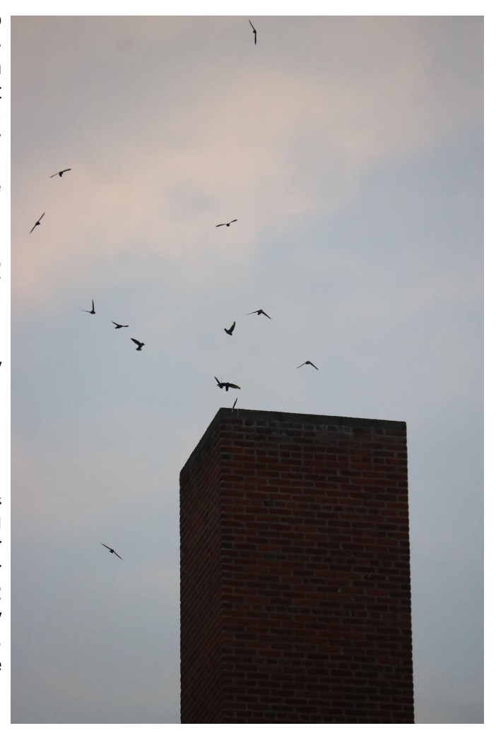
at the Bend Boys & Girls Club chimney, August 2021

Fall 2021 To our knowledge, the Boys & Girls Club chimney is the Bend roosting site of choice for this migration. Our highest counts have surpassed all other fall migrations since beginning in 2012 with mega counts ranging from nightly highs of 1150-3200 in September! Counts have finished up but collective totals are not yet available.