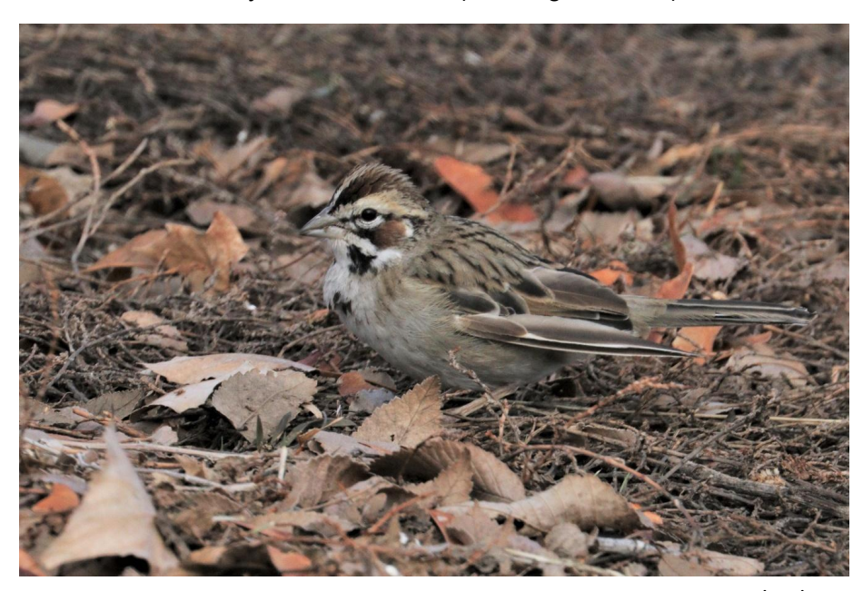
Lark Sparrow – Prineville Country Club 12/11/20

A SWAMP SPARROW spent much of the winter at Hatfield Lake and was seen by multiple observers. SAVANNAH SPARROW reports came in from Culver on Dec 20 (Gates, Nordstrom), off Lower Bridge Road near Terrebonne on two occasions (Low, Nordstrom), and on the Agency Plains on Feb 15 (Gates). Central Oregon's first December record of LARK SPARROW occurred at the Prineville Country Club on Dec 11 (Schlanger, Gates).