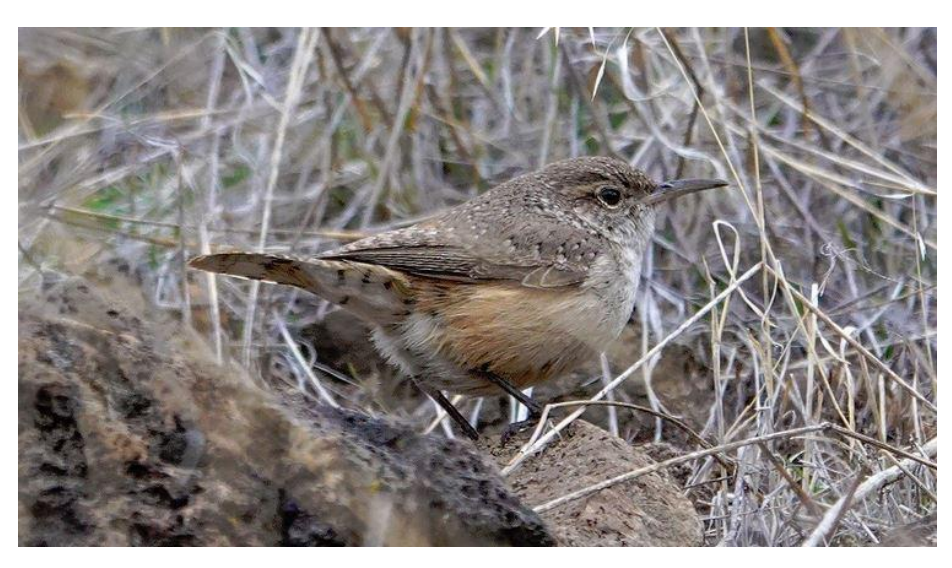
Rock Wren – Borden Beck Trail 1/11/21