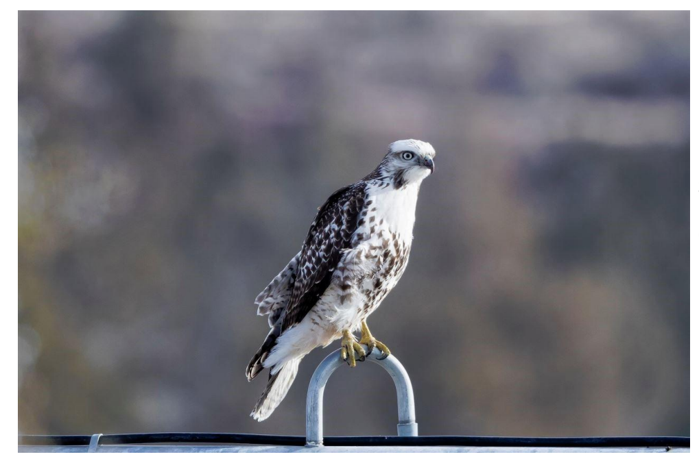
Harlan's Red-tailed Hawk – Redmond Sewer Ponds