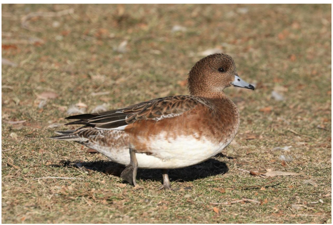
Eurasian Wigeon – Fireman's Pond, Redmond Photo by Chuck Gates 12/5/20

Many species of waterfowl spend their winter vacation in our area. SNOW GEESE were widespread with a high count of 10 individuals seen near Sisters on Feb 11 (Froehlich). CACKLING GEESE were somewhat more common than the "Snows" with over 30 reports and a high count of 21 seen at Agency Plains on Feb 20 (Low). TRUMPETER SWANS were noted along the Crooked River (Gates), near Prineville (White), at Pronghorn Resort (Lear), and Hatfield Lake (Medrano). Seven different EURASIAN WIGEONS were reported from various locations including a very cooperative female at Fireman's Pond in Redmond (Gates).