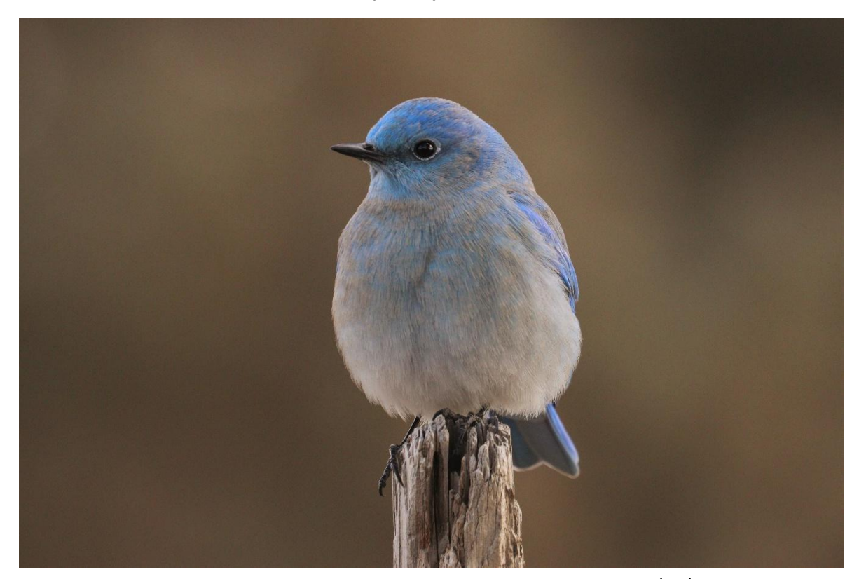
Mountain Bluebird - Powell Butte - Photo by Chuck Gates 2/26/21

MOUNTAIN BLUEBIRDS are expected in small numbers every winter, but this season's numbers were exceptional as illustrated by a tally of 486 birds in Alfalfa on Jan 31 (Low).