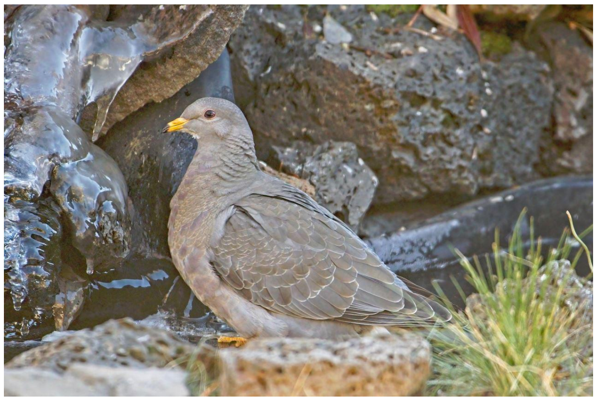
Band-tailed Pigeon – Deschutes R. Woods 12/3/20

Game Birds rarely migrate so they can be found occasionally in winter. MOUNTAIN QUAIL were discovered at Lake Billy Chinook on Dec 4 and were seen by multiple observers throughout the winter (Crabtree, et al.). CHUKAR were spotted at Pelton Overlook on Dec 27 (Crabtree) and at Smith Rock State Park on Feb 24 (Thomas, Olsen). Single BAND-TAILED PIGEONS were recorded at Deschutes River Woods on Dec 1 (Moodie) and on Dec 24 on Bend's west side (Stacey).