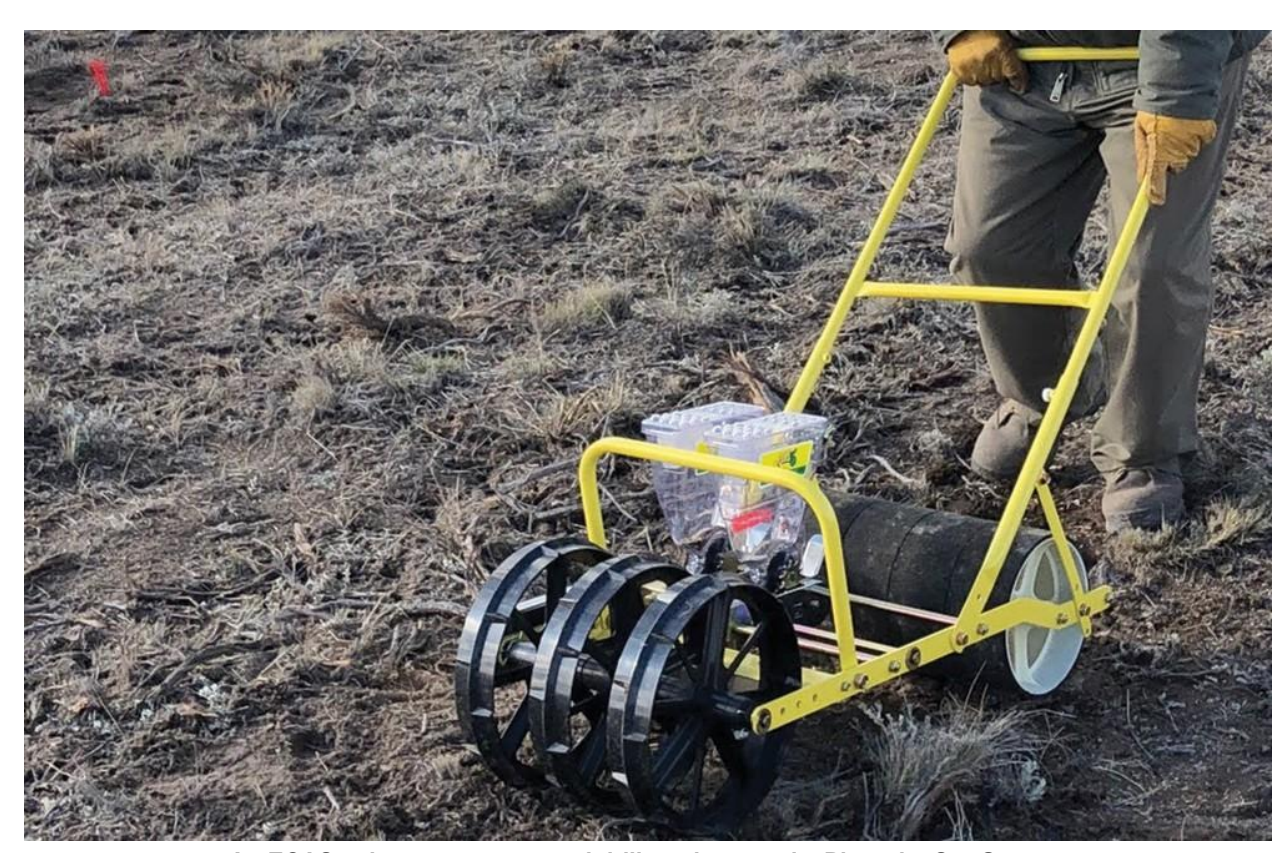
An ECAS volunteer uses a seed drill to plant seeds.

The group and other researchers came up with a reason associated with this decline — the dearth of native bunchgrasses and wildflowers (forbs) growing in the area. After consultations with agency personnel and ecologists at Oregon State University, the group decided to study how to restore the understory of native grasses and forbs. A rancher near Brothers permitted the group to conduct the study on their ranch property. One thing the group discovered from their untreated study plots was a lack of seeds in the soil — essentially the seed bank is empty because of the lack of grasses and wildflowers, which become established in the early successional stages of the sagebrush-steppe habitat.