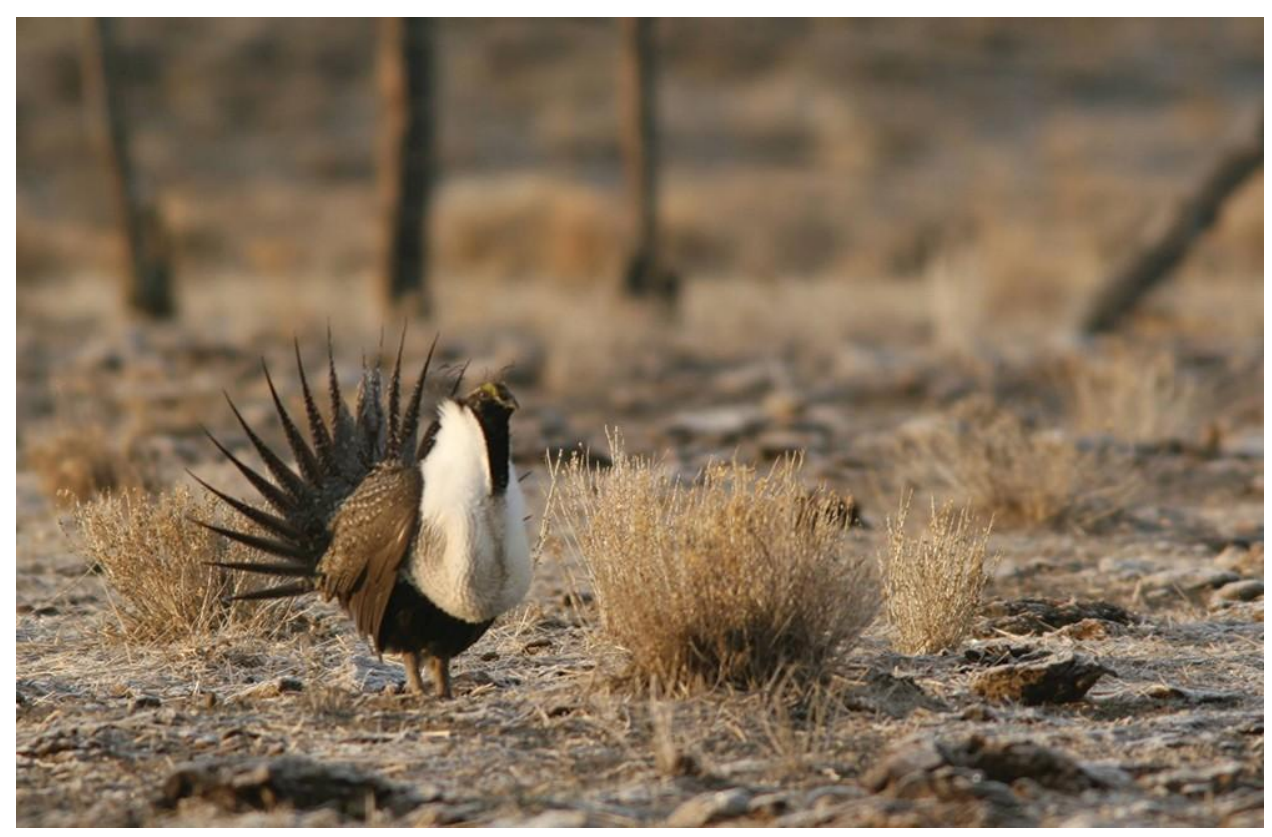
A male sage-grouse puts on his display at a lek out in the Oregon badlands.

Greater Sage-Grouse are iconic birds of the sagebrush landscape. Their entire life history centers around this habitat type, from nesting sites to food sources, making them a key species across 11 western states and two Canadian provinces. But as icons, this doesn't make them immune from impacts. Threats to the sage-grouse such as habitat loss, invasive plants, mining, nest predation, wildfires and other aspects have significantly reduced the bird's population across the Intermountain West since the 1960s.