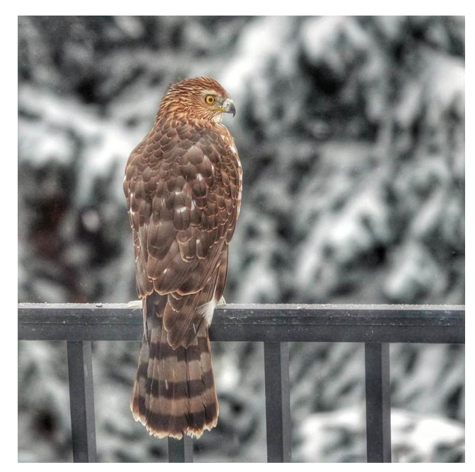
Cooper's Hawk, Redmond

From the ECAS Facebook page by local photographers