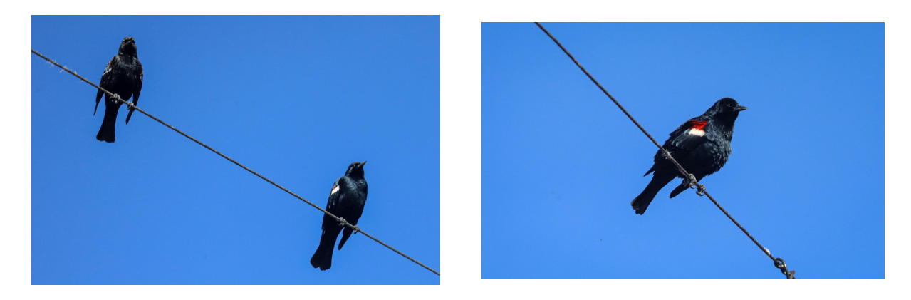
Red-winged, Tri-colored, and Tri-colored Blackbirds, left to right, Prineville, Chuck Gates