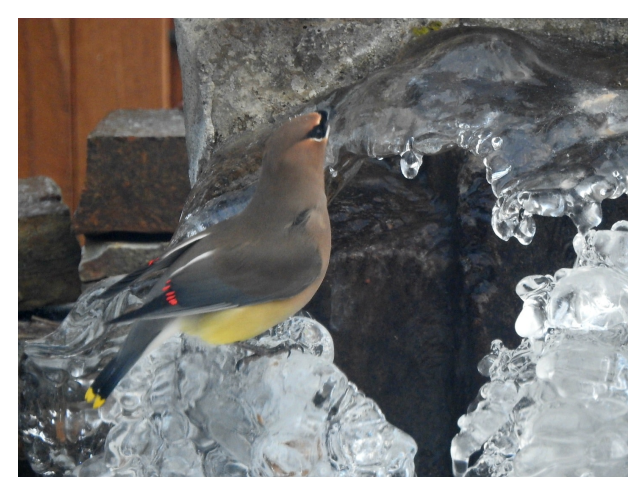
Cedar Waxwing, Tumalo